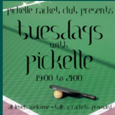
Pickelle by Chloe Day