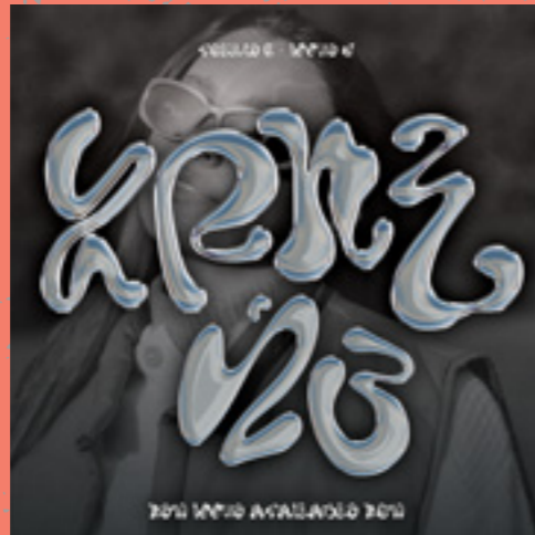
Gloop by Abbey Purcel